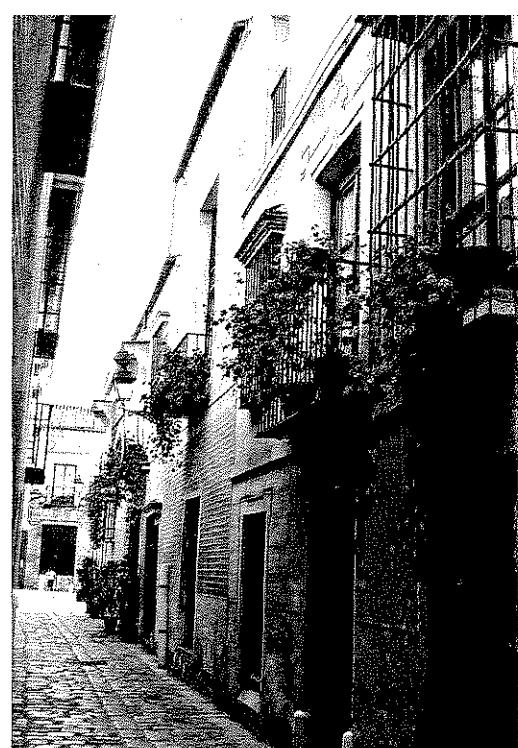
A street in Seville

telling gypsies, we listened to flamenco guitar in a café serving both almond cakes and hookahs for a special smoke!