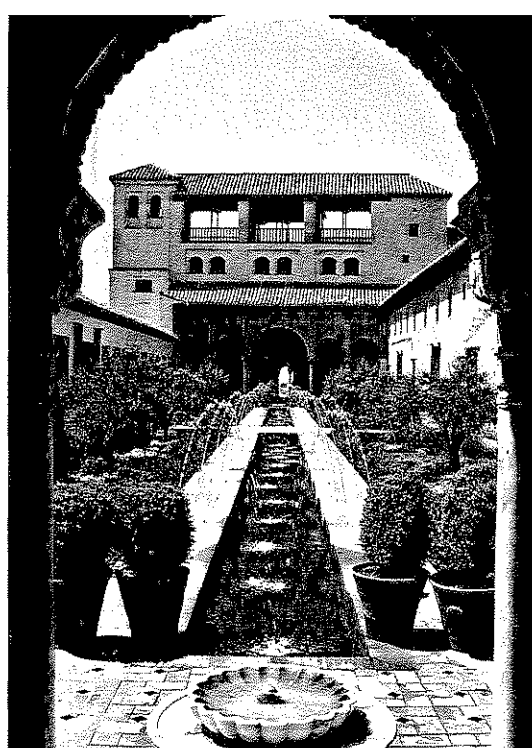
In the Alhambra: Reflection Pool